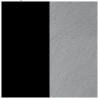
Black/Satin Aluminum - BSA